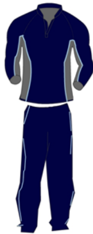
Boys Reversible Sports Top