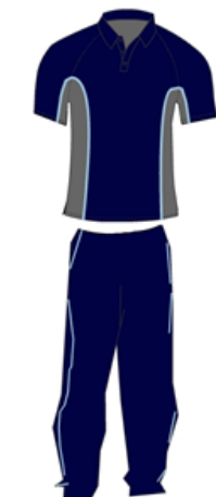
Boys Polo and Track Pant