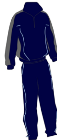
Track Top and Pant

Above garments are in Navy with Grey panels (where applicable) and Sky Piping